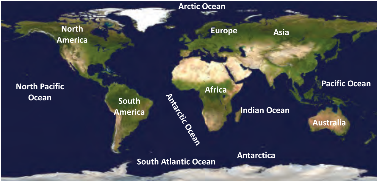
World : Continents and Oceans

difficulties in its use. A map removes these difficulties. A map is the layout of the earth made on a flat surface. It may be of the whole earth or a part of it. It can also be folded or rolled up. Look at the map of Asia given below. A map can be carried anywhere easily.